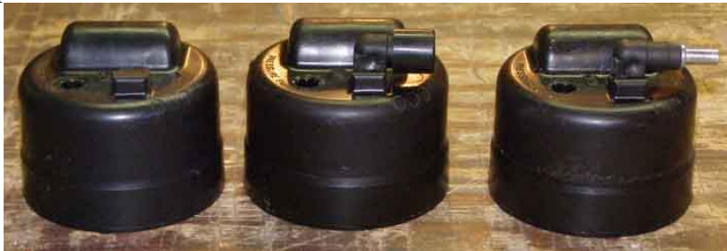
End covers with, 1) no vent, 2) Vent with jiggle cap and 3) vent with vent line fitting

The vent on the end cover of the pump is not there to cool the electrics, as has been stated from some sources, it is just an additional vent for any pressure caused by the upward travel of the diaphragm to be expelled from.