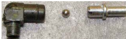
Check valve in end cover

There is no vent line to a dry spot attached to the vent on the end cover (if one exists) as there is a check valve inside the vent that prevents any air being drawn in at this point. If your pump has an end cover without this vent, don't be concerned as some pumps come without it and they function perfectly well without it.