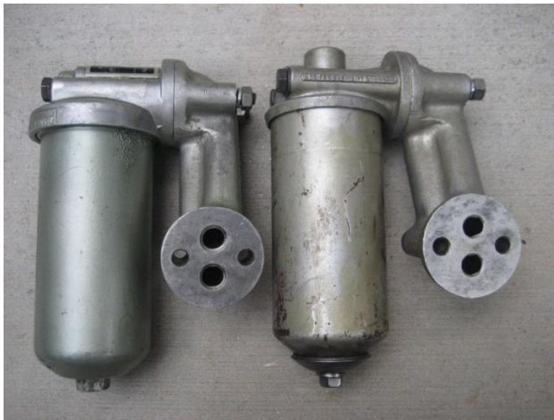
Tecalemit Oil filters, early-left versus late-right.

Engine no. 207112 Apr '54 – New type of Tecalemit oil filter introduced. Purolator oil filter not changed, and used throughout BN1/2 production.