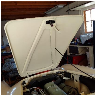
Body no. 724

Body no. 724 (c1496XX) Nov '53 to body no. 877 (c149XXX) Nov./Dec. '53 – Sometime during this period, a side to side cross brace was added to the aluminum bonnet frame for strength and stiffening. This brace is a rectangular “U” shaped channel attached to the underside of the “V” brace with four truss head sheet metal screws. The exact changeover body no. is unknown and may be before no. 877.