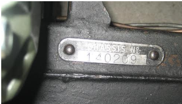
Chassis tag riveted to right frame rail.