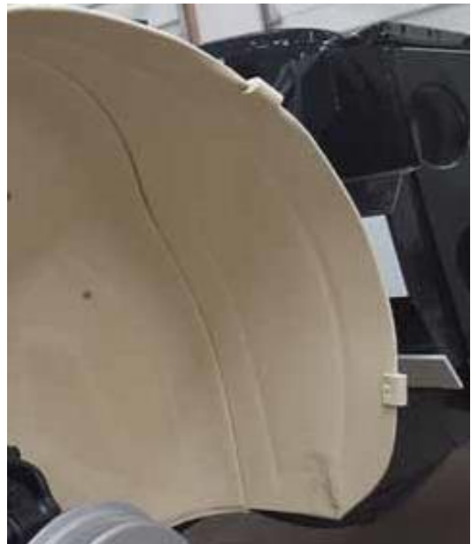
BN1 no. 7197 with stiffening ridges.

Body no. 11143 (c229180) Nov '55 – Improved rubber seal between door and scuttle to prevent water entering at this point.