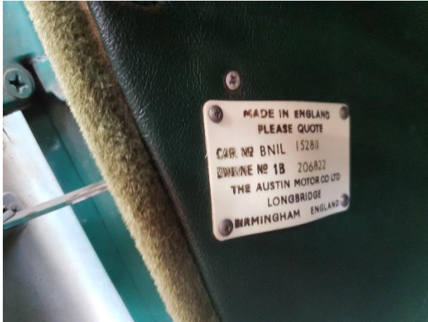
Plastic chassis & engine no tag in foot well.

Chassis no. 219001 Sep '54 – First car with unified chassis/engine number, and the preceding series of engines used in AH 100s appears to have ended in the range of 216XXX. This appears to be the point where the plastic chassis and engine no. tag on the foot well trim panel was changed to the oval aluminum unified chassis/engine no. tag. Also, at this point the aluminum chassis tag was removed from the right frame rail in the engine compartment by the master cylinder bracket, however the two mounting holes for this tag remained through the end of BN2 production. This new oval aluminum tag remained in the driver's foot well at least until early Jan. '55, when it was moved to the firewall below the batch/body number tag.