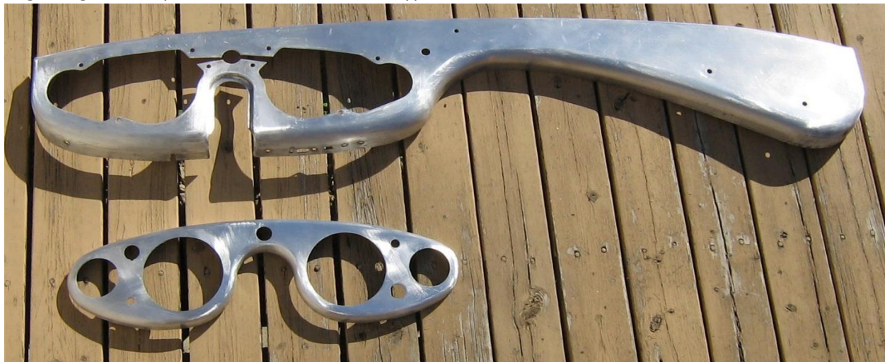
This type pictured above is the later type for cars with non-adjustable steering. Note the flange extension in the "U" shaped channel for the steering column. This type had the rounded tabs on the back, versus the square tabs.

Body no. 1855 (c151795) Feb '54 – Fascia and instrument panel changed from two piece to one piece. Regarding the two piece dash, there were two types and two removable instrument cluster sections.