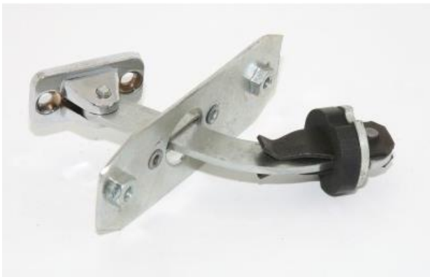
Moss Motors current offering of the later assembly.