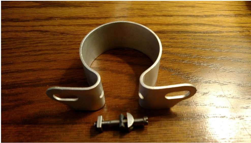
The BN2/100M coil brackets were very unique and looked like this photo above.

Chassis no. 227339 Jul '55 – New type of lifting jack. King Dick B. 1077 (not dated).