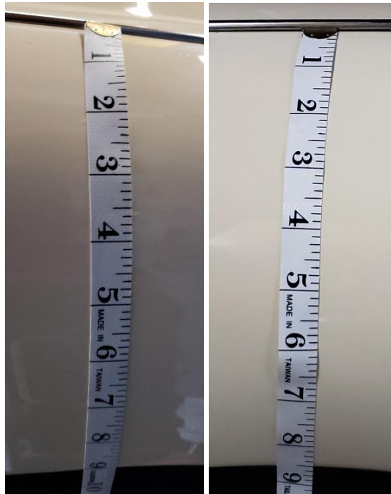
BN1 right wing 9" No. 7197 Jan. '55