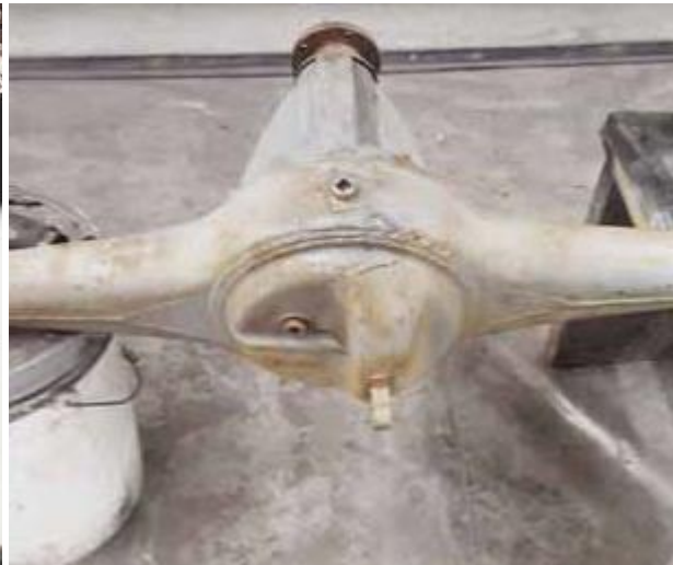
BN2 Hypoid Bevel rear axle filler pug on top of axle casing.

Also, the rear hub lock nut threads became “handed”, with left- and right-hand threads, instead of both sides having right hand threads.