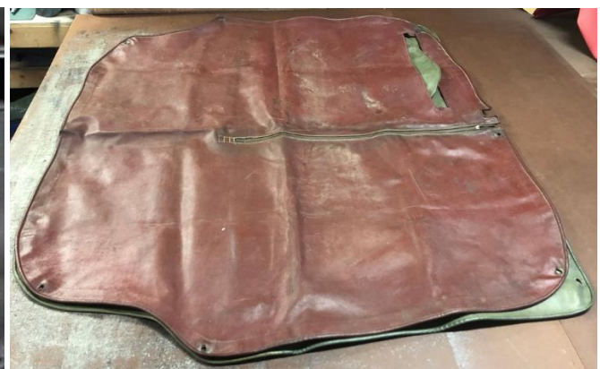
Early narrow cover over later wider tonneau.

Chassis no. 159801 Aug '54 – Flat hub wire wheels fitted up to this chassis number.