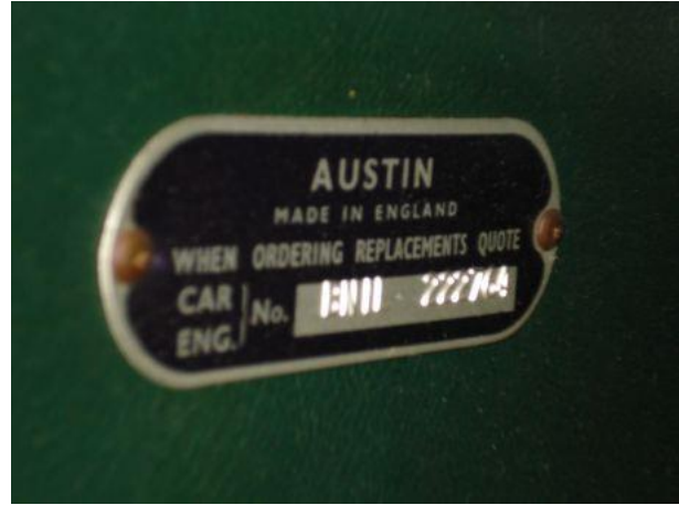
Oval metal (aluminum) chassis tag in foot well.