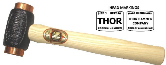
Thor Size 1 copper/copper hammer.

Body no. XXXXX (c2XXXXX) Nov '55 – Stiffening ridges on front inner fenders eliminated?