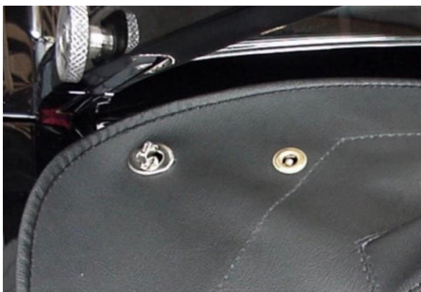
Wider BN1, BN2 Tonneau cover w/ turn button and grommet

Body no. 4606 (c159339) Jul '54 – Wider tonneau cover with improved fasteners.