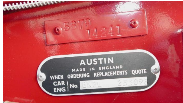
Oval metal (aluminum) chassis tag moved to firewall, underneath the batch/body tag.

Body no. 5100 (c219046) Sep '54 – Aluminum door hinges changed to steel. Improved check straps.