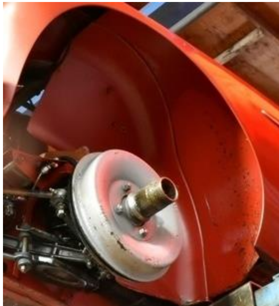
BN2 no. 13340 w/out front inner fender stiffening ridges.

Body no. XXXXX (c2XXXXX) Nov '55 – Stiffening ridges on front inner fenders eliminated?