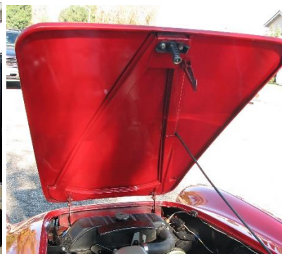
Body no. 598