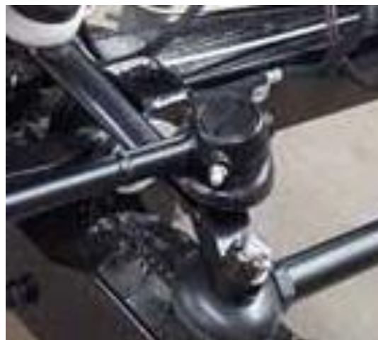
Non-adjustable ball pins. No. 7197.