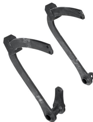
These are reproductions, note the strengthened clutch pedal, which I don't believe is original.

Chassis no. 225780 May '55– Oil filled aluminum ignition coil replaced the original black steel B12/1