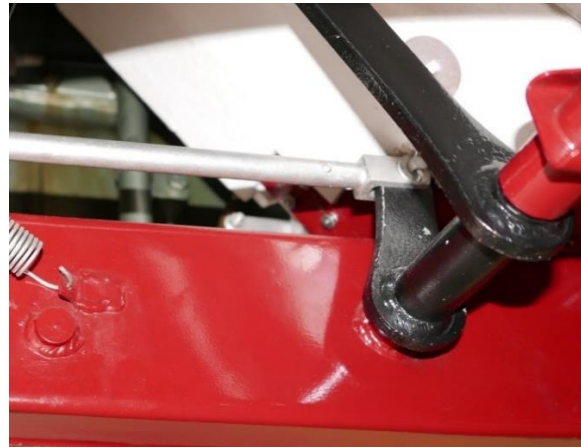
BN1/2-Brake pedal strengthened.