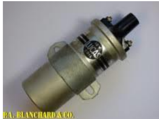
Lucas late BN1, BN2 coil, model HA 12, part no. 45054D/E.