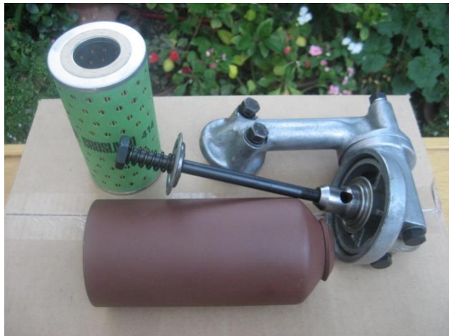
Purolator filter assembly.