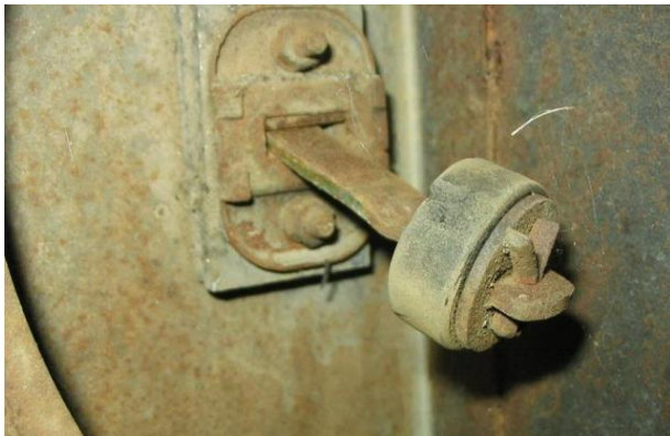
Original assembly from a very early BN1.

Body no. 5100 (c219046) Sep '54 – Aluminum door hinges changed to steel. Improved check straps.