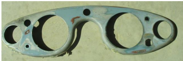
This is the instrument cluster section for the dash above. This would have had the "square" tabs on the back.

Body no. 1950 (c152100) Feb '54 – Improved bonnet catch, lock nut replaces lock ring for striker pin.