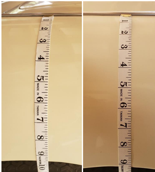
BN1 left wing 9-1/2" No.724 Nov. '53

Body no. 1001 (c149930) Dec '53 – Front wings with 3/16" to 1/2" higher wheel cutout. 9" from beading to top of the wheel arch. Therefore, most early BN1s before body no. 1000 had front wings whose wheel cutout from beading to top of the wheel arch was approximately 9-3/16" to 9-1/2".