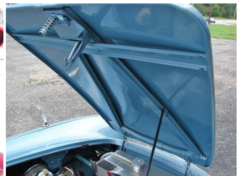
All cars, body no. 877 and after to no. 3396

Body no. 1001 (c149930) Dec '53 – Adjustable steering column discontinued, driver's seat now on slides. The smaller hub of the non-adjustable steering wheel necessitated a decrease of the width of the aperture in the fascia (dash). The chromed turn signal lever which denoted an adjustable steering column was replaced with a black “beak” type which denoted a non-adjustable steering column. Austin Service Journal dated 10 May 1954 addresses this change.