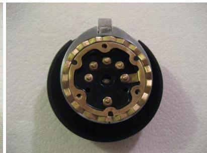
Early adjustable, back side.