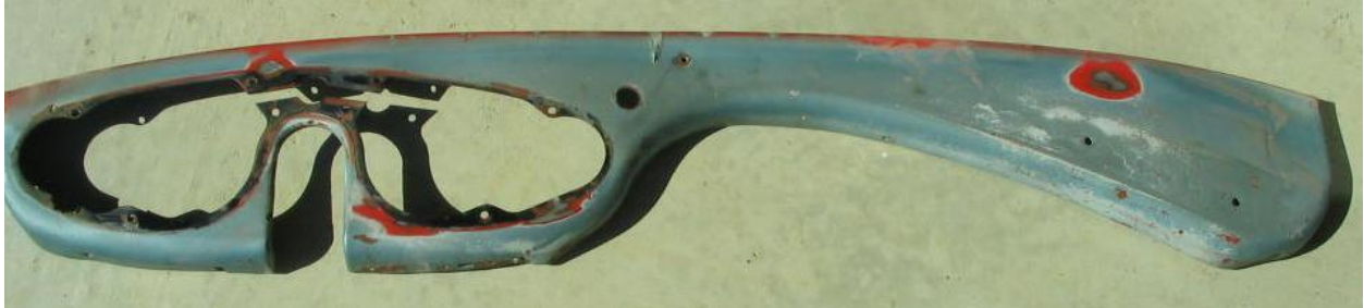
Early adjustable steering dash. Note the lack of the extra flange in the "U" shaped channel.

Two-piece dash instrument cluster held in by eight, no.2 BA or no. 10-32 Phillips pan head screws (pictured right).