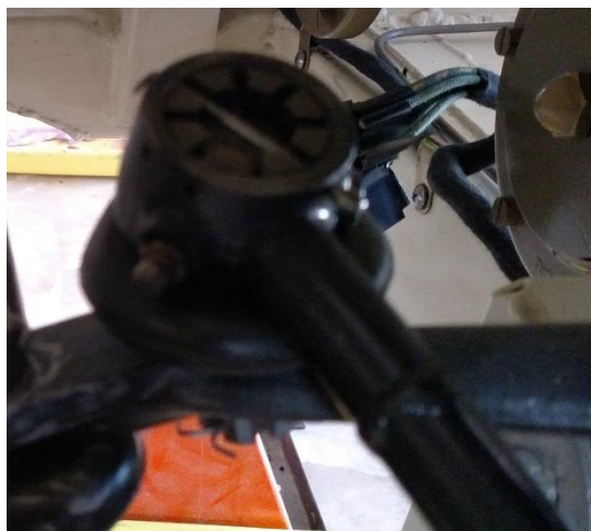
Early adjustable ball pins. No. 724

Chassis no. 157624 Jun '54 – Steering cross and side tubes changed to non-adjustable ball pins versus the adjustable pins of earlier cars.