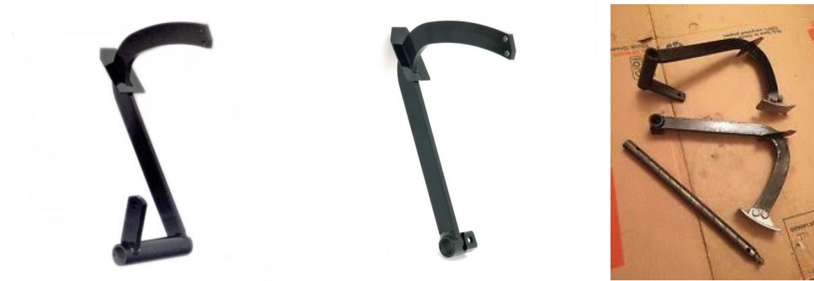
BN1 original brake and clutch pedals. Note how they are "butt" welded to the shaft.

Chassis no. 222781 Dec '54/Jan '55 – Brake pedal lever strengthened.