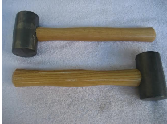
Accurate reproductions of the BN1/early BN2 lead knockoff hammer.

Chassis no. 229654 Nov '55 – Lead hammer in tool kit replaced by Copper hammer.