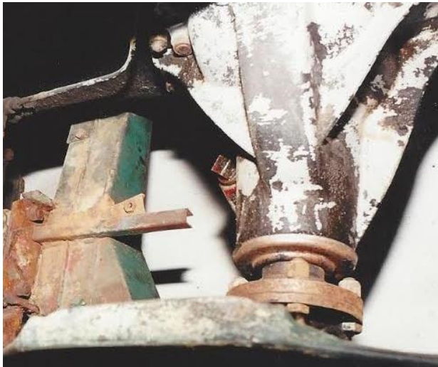
BN1 Hypoid Bevel rear axle filler pug on carrier. Note original red paint remnants on plug.

Chassis no. 228012 Aug. '55 – Oil filler plug moved from differential carrier to the rear of the axle casing.