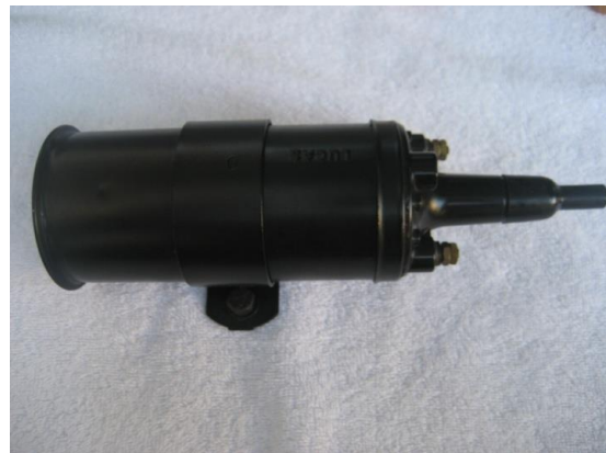
Original BN1 coil, model B12, part no. 45012A/D.

Chassis no. 225780 May '55– Oil filled aluminum ignition coil replaced the original black steel B12/1