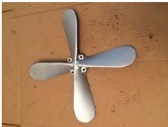
Round tipped fan, unpainted.

Chassis no. 157624 Jun '54 – Steering cross and side tubes changed to non-adjustable ball pins versus the adjustable pins of earlier cars.