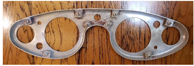
Left- Late non-adjustable cluster w/ rounded tabs