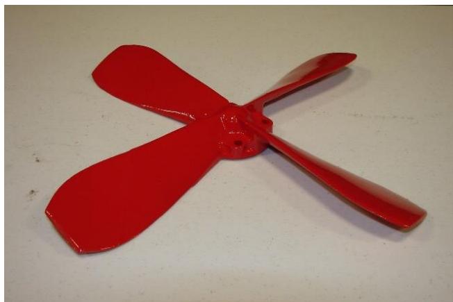
Square tipped fan, painted in correct "Chinese" Red.

Engine no. XXXXXX Xxx '54 – Engine fan blades changed from having round tips to the more squared off tips. The latest known/documentated car with the rounded fan blades is body no. 3015.