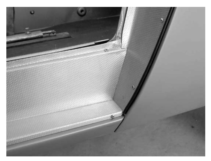
Photo I: Aluminum facing pieces on a BI8; the horizontal sill piece traps the shut face piece behind its vertical and horizontal rear edges. The edge of the shut pillar piece is trimmed so that the piping edge ends up about 1/8 inch back from the outer face of the rear wing.

It will not be possible to insert the front screw into the outer, lower lip of the sill plate until the door has been removed, so make a note to do this later. Also, on 6-cylinder cars, fitting of the sill protecting piece, which lays over the door draught seal, should be delayed until trimming of the interior.