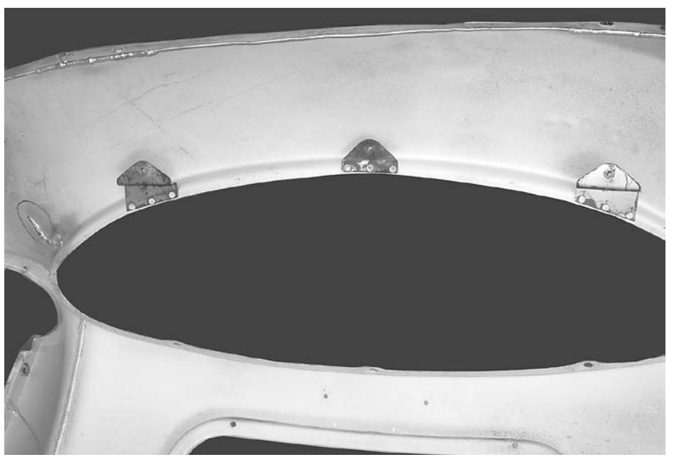
low for final adjustment. Remember that shims Photo 2. This view shows the three lower mounting tabs for the grille. Note, view is from inside the

Top Frame With the windshield in place it is important to check out the top frame (especially before having it painted or powder-coated):