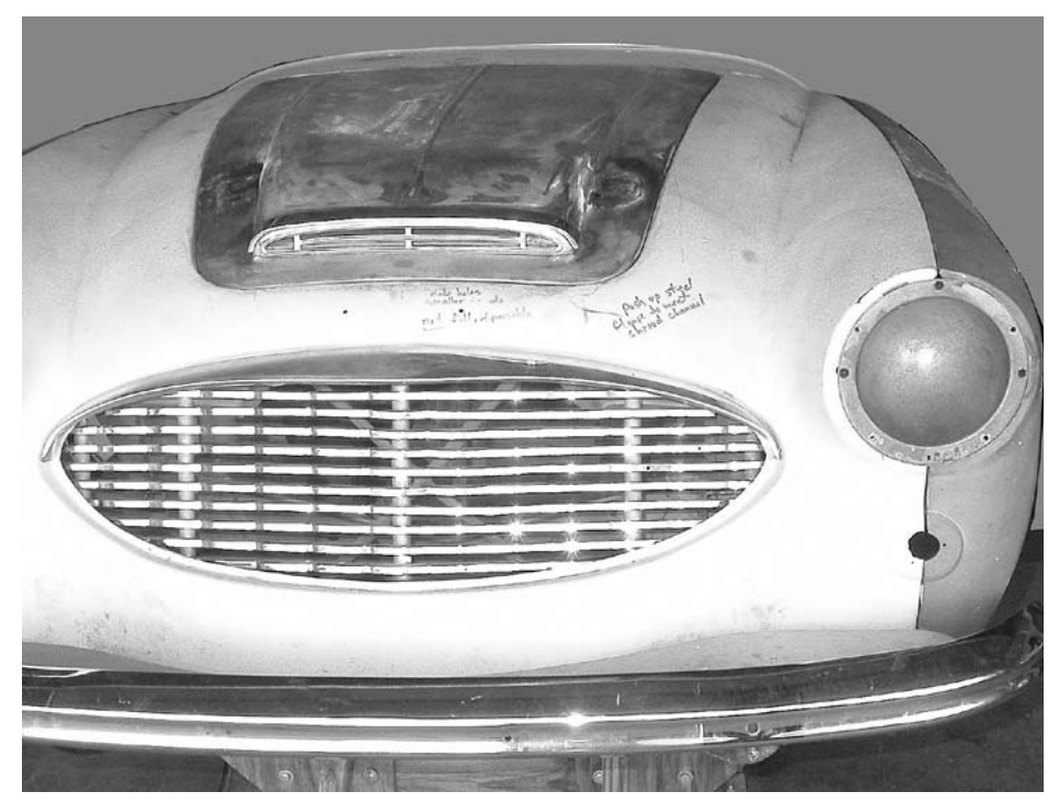
Photo 3: Fitting the grilles – this includes rounding up all required fasteners. Note that the unpainted headlight bucket and the bumper have been mounted to check body panel shape.