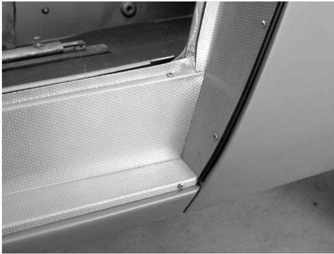
Photo 1: Aluminum facing pieces on a BJ8; the horizontal sill piece traps the shut face piece behind its vertical and horizontal rear edges. The edge of the shut pillar piece is trimmed so that the piping edge ends up about 1/8 inch back from the outer face of the rear wing.

It will not be possible to insert the front screw into the outer, lower lip of the sill plate until the door has been removed, so make a note to do this later. Also, on 6-cylinder cars, fitting of the sill protecting piece, which lays over the door draught seal, should be delayed until trimming of the interior.