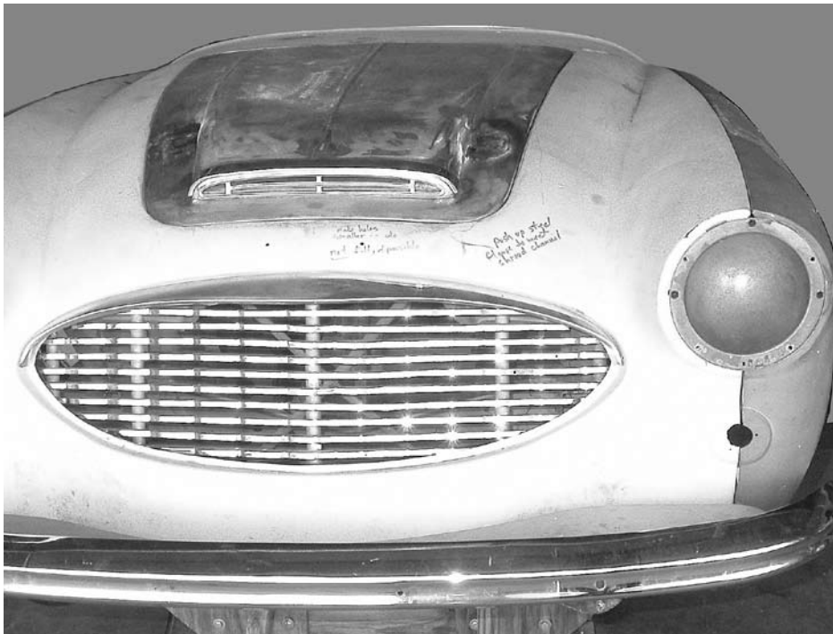
Photo 3: Fitting the grilles – this includes rounding up all required fasteners. Note that the unpainted headlight bucket and the bumper have been mounted to check body panel shape.