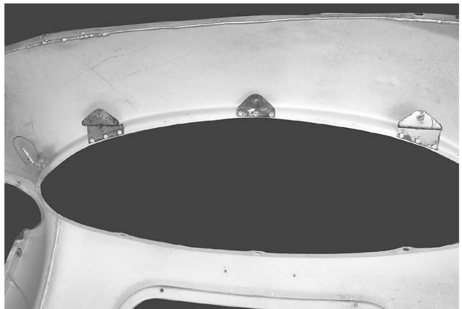
Photo 2. This view shows the three lower mounting tabs for the grille. Note, view is from inside the shroud and the shroud is inverted.

Top Frame With the windshield in place it is important to check out the top frame (especially before having it painted or powder-coated):