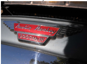
DSCF3006 .JPG saved - Badge restoration.05a.jpg

--(The Other) Len Fairfield, CA, USA 1967 AH 3000 MkIII, HBJ8L39031