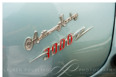
Badge on bonnet-hyphenated or not.02.jpg

A local photograph took this shot of my BJ7 boot badge (HBJ7L-20969) while it was parked in the parking lot at the Misslewood Concours in Beverly, MA this summer (with hyphen)