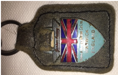
Saved - Badge restoration.06a.jpg