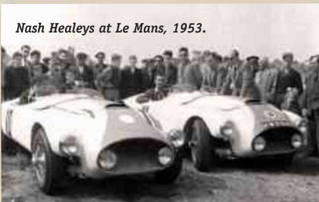
Nash Healeys at Le Mans, 1953.