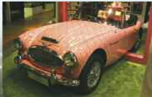
The Carolina Herrera promotion BJ8 at Heathrow airport.