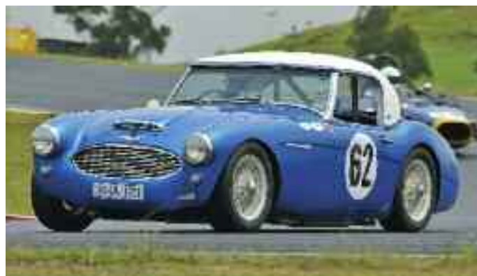
Steve Pike in action at Eastern Creek in his 3000.