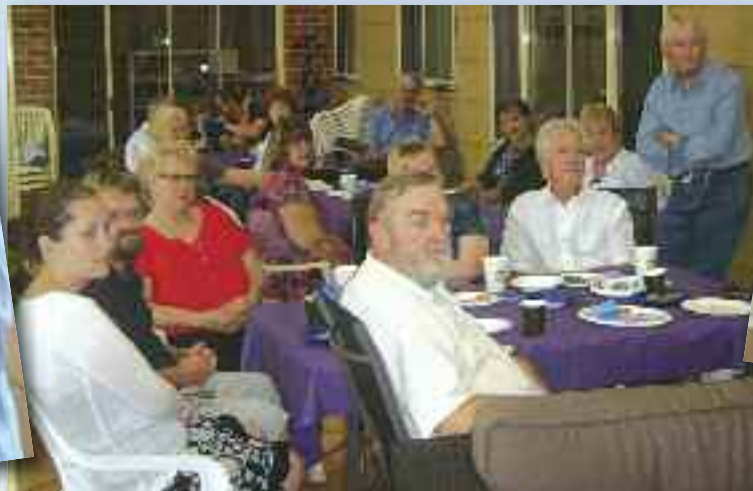
The amassed throng looking suitably impressed.