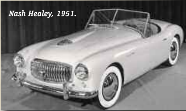
Nash Healey, 1951.