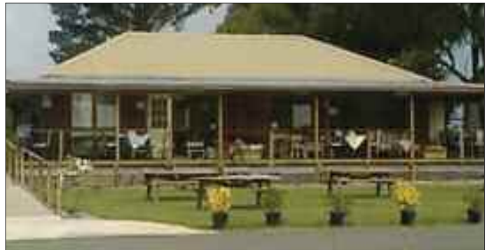
Werai Tea House – 4 Greenhills Road Werai