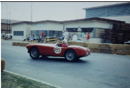
The Webb Canepa Collection of the Revs Institute (1,128 items)