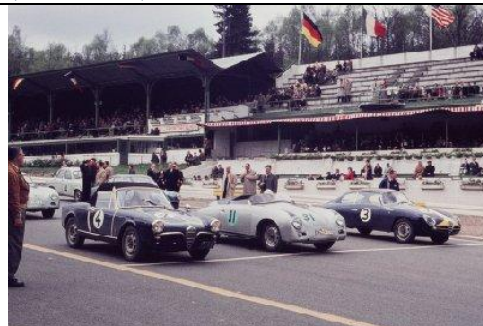
The Jean Charles Martha Photography Collection of the Revs Institute (1,049 items)