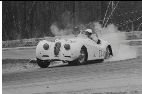
The David Nadig Collection of the Revs Institute (6,372 items)