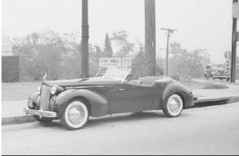
The John Dugdale Collection of the Revs Institute (689 items)