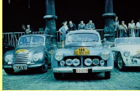
The Marcus Chambers Collection of the Revs Institute (279 items)