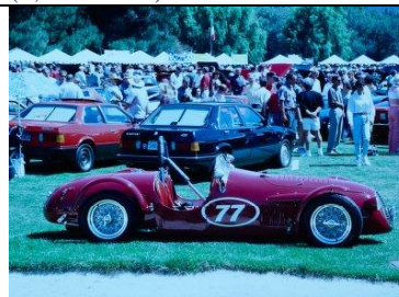
The William Hewitt Collection of the Revs Institute (21,472 items)