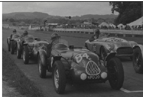
The George Phillips Collection of the Revs Institute (51,814 items)