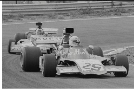
The Ove Nielsen Photographic Archive of the Revs Institute (18,365 items)