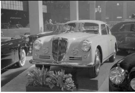
The Karl Ludvigsen Collection of the Revs Institute (54,076 items)