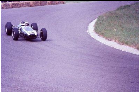
The Max LeGrand Photograph Collection of the Revs Institute (3,490 items)