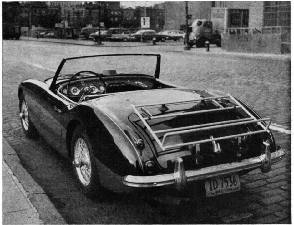
This easy-to-build trunk rack will easily carry two suitcases. Dimensions given are for Austin-Healey rack shown, but can easily be adapted to most sports cars.

Cut the aluminum tubing into four "A" lengths (see drawing), two "B" lengths, one "C" length and two "D" lengths. Edges should be smoothed with a knife. Then drill holes for assembly bolts and for attaching the