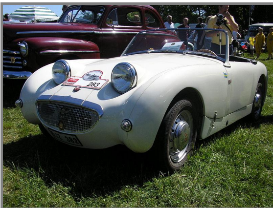
1958 Austin-Healey Sprite