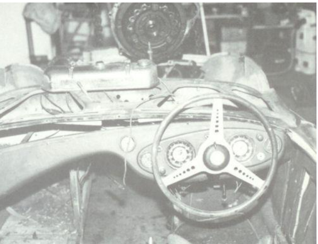
Fortunately Clapham realized what he had to do and raced down to Heathrow with a trailer behind his estate car (that's, "station wagon" to us Yanks. -Ed.) and quickly got it loaded up and away. It is now safe in the Midlands and will be carefully rebuilt to correct specifications.

The car was complete with all documentation and many spare parts, including an alternative crown wheel and pinion set and the factory-supplied "Quicklift" racing jack. (The chassis has special pickup points front and rear to accept this tool. These points are peculiar to the 1 OOS chassis and do not appear on the standard 100.) The car also had a metal half-tonneau and full engine under-tray. This car will raise a great deal of interest when it appears in public, possibly in 1988.