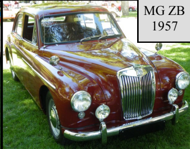
MG ZB 1957