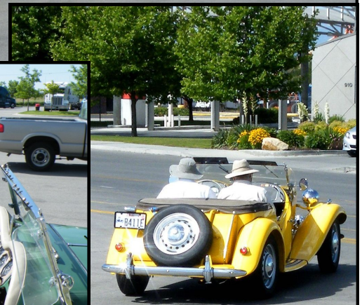
Jerry with copilot in MG TD head out as second car away.