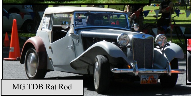
MG TDB Rat Rod