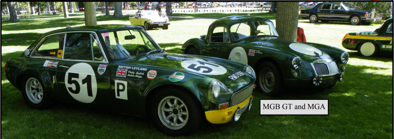
MGB GT and MGA