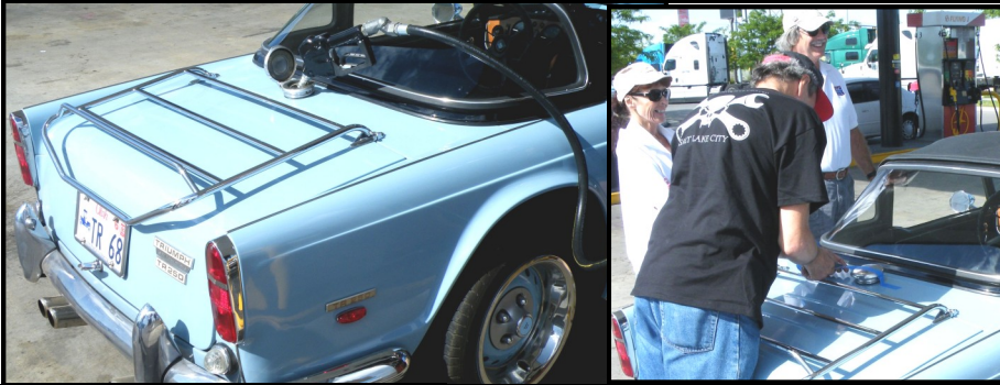
Rich's 1968 TR250 gets topped up and taped.