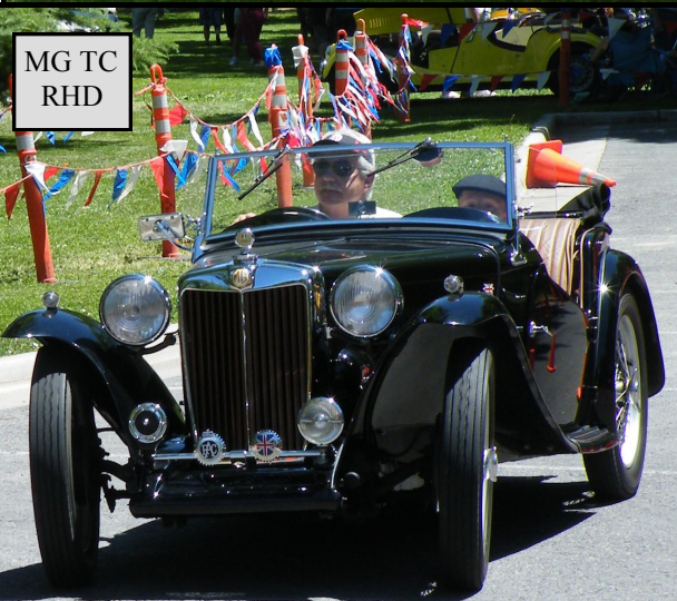
MG TC RHD