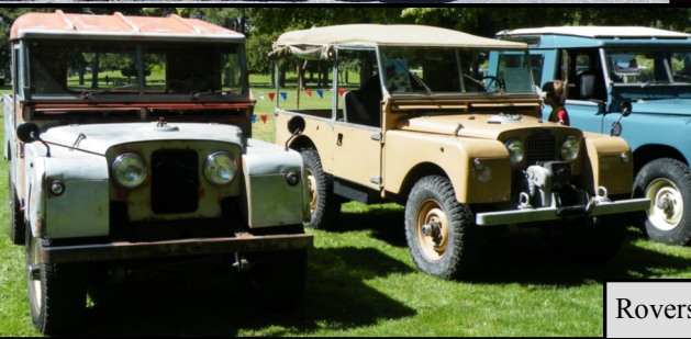
Rovers new and old.