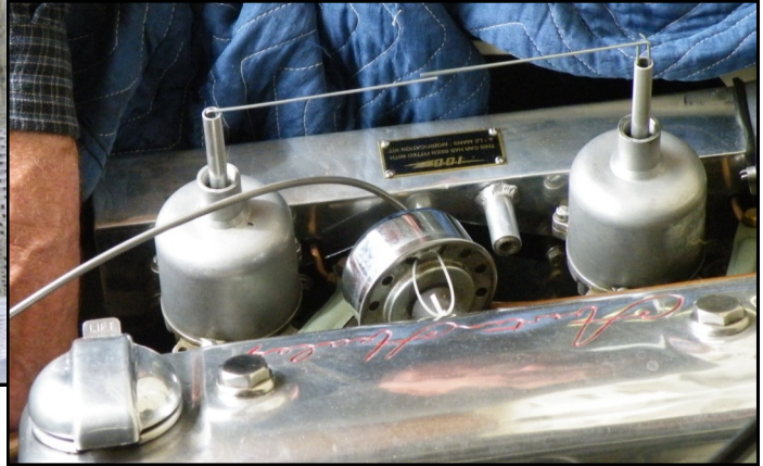
Moss kit being used for adjustment (Austin-Healey).

(I had read somewhere that “carburetor” is the French word for “do not touch this.” editor)