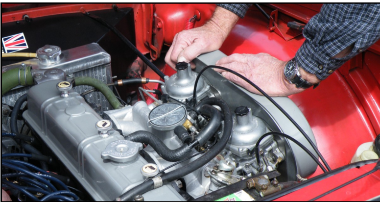
Zenith Strombergs (TR6) weren't forgotten.