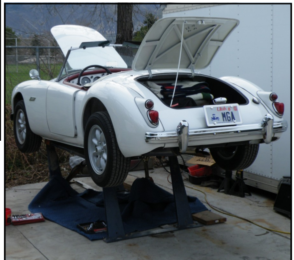
MGA on the lift.