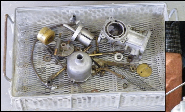
In the parts basket for cleaning.

(I had read somewhere that “carburetor” is the French word for “do not touch this.” editor)