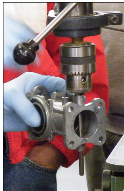
Dave Maxwell reaming carb housing for throttle shaft bushing..